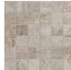
RIFT GRAVEL MOSAIC 11 3 / 4 "x11 3 / 4 " - 30x30 cm