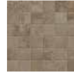
RIFT PORTLAND MOSAIC 11 3 / 4 "x11 3 / 4 " - 30x30 cm