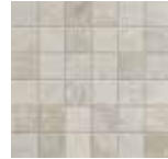
RIFT CHALK MOSAIC 11 3 / 4 "x11 3 / 4 " - 30x30 cm