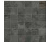
RIFT BLACKTOP MOSAIC 11 3 / 4 "x11 3 / 4 " - 30x30 cm